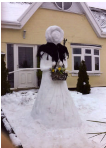
The Ice Lady - See Community Highlights report on page 6

If anyone has any photos, memories or anything else of interest we can use, please contact me on 02920892865