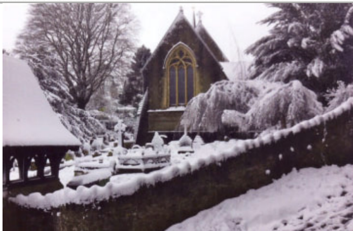
St Catwgs Pentyrch See Community Highlights report on page 6