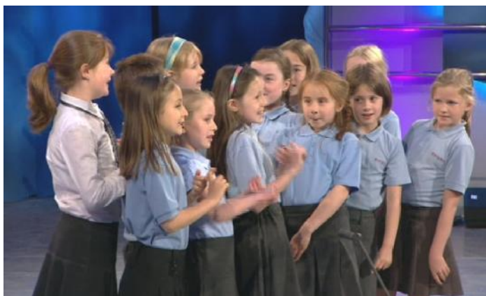
Grŵp Llefary Ysgol Creigiau yn Eisteddfod yr Urdd