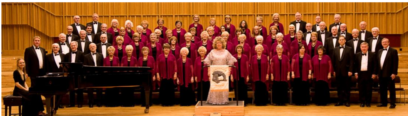
Cantorion Creigiau celebrating 40 years