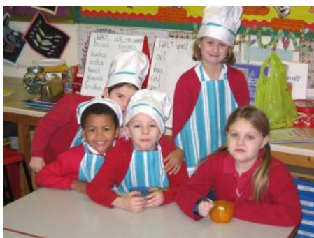
The Breakfast Team

To coincide with our visit, representatives from our partner schools in France, Sicily and Turkey joined us in Helsinki. On our last day together we all enjoyed a concert prepared by the children at Suutarila School. One of the highlights of the trip was on the final evening, when the children visited the homes of their Finnish friends. We are now planning to welcome our Finnish friends to Wales in April.