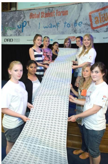
Radyr Students hold a tally chart representing the shocking number of children that died during the course of the conference.