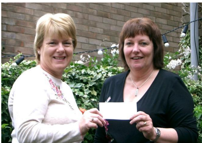
Handing over cheque to the Village Hall