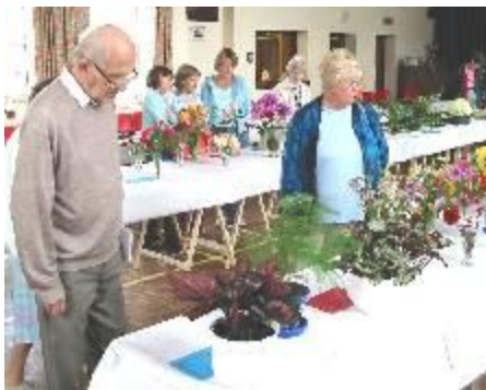
Scenes from last year's Pentyrch Show