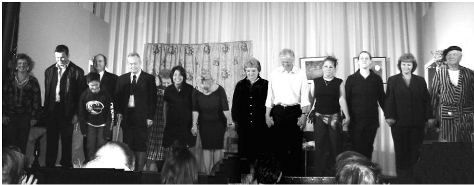
The cast of One O'clock from the House

The Hilltop Theatre Company has been very busy since its formation last September. Its first major production was "Our Town" last November which was hailed as a great success with full audiences and received many kind words of praise and congratulations.