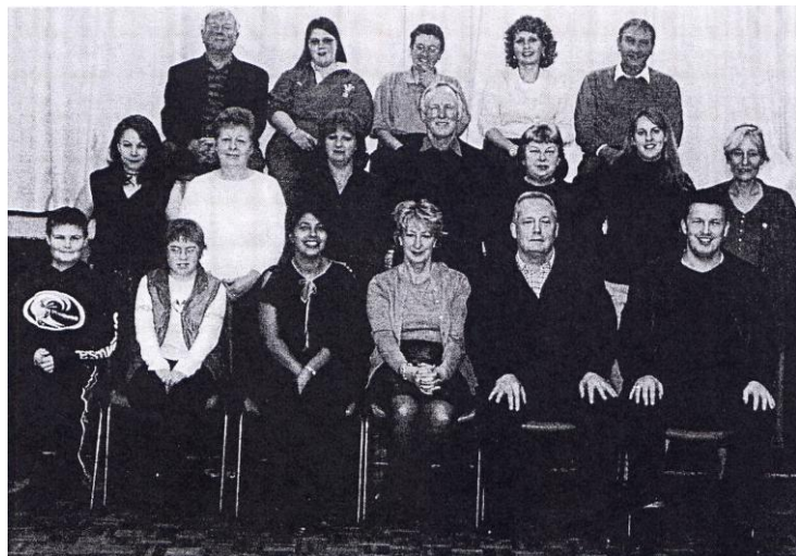
The Production Team