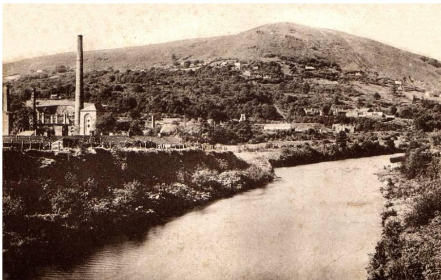
A view of the Garth and the old Iron Works around 1900

03/00787/W Mr A West, 1 Green Acre, Creigiau/St Fagans, Cardiff Porch