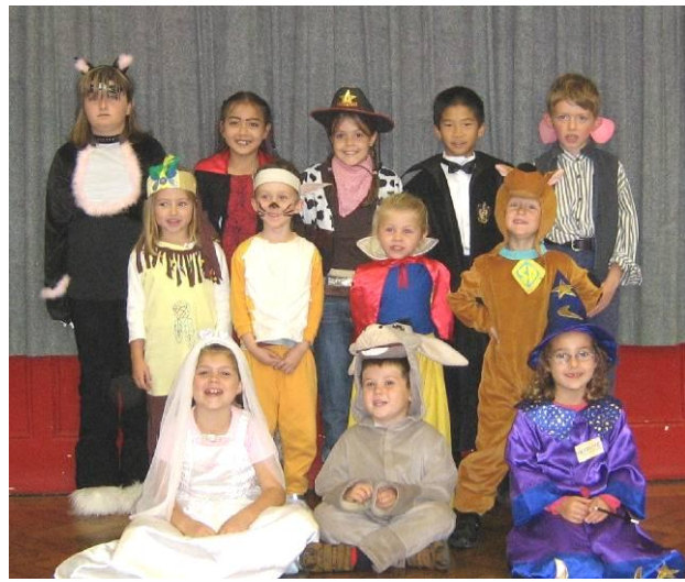
Book Week Costumes