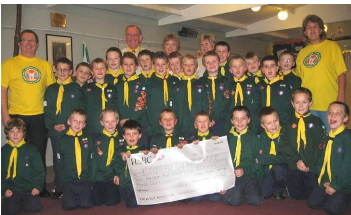
Presentation of a cheque from the Carnival Fun Run to the Cubs

However, a word of caution – please do not take the carnival events for granted: we are in grave danger of losing the jewel in our crown. Some of our longer serving committee members would now like to step down and hence there is an urgent need for new members to come forward and take their place in order to help keep this village tradition alive.