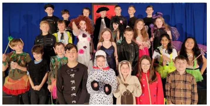
CYNGHERDDAU NADOLIG Llongyfarchiadau i'n holl ddisgyblion ar gyngherddau Nadolig gwych ym mis Rhagfyr. Roedd pawb a fynychodd wedi mwynhau'r perfformiadau.

Congratulations to all our pupils on their superb Christmas concerts on December. Everyone who attended thoroughly enjoyed the performances.