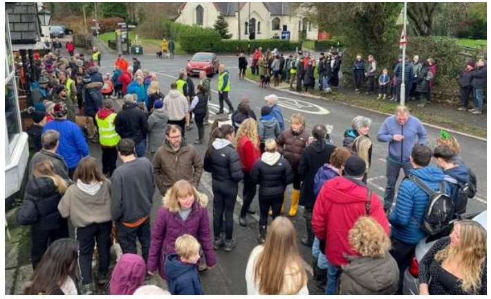
CREIGIAU BOXING DAY WALK

Creigiau 23 volunteers working hard to provide refreshments for up to 500 on Boxing Day walk. A bumper turnout to add to those attending Xmas Eve to see Santa! Thanks to Creigiau Inn & Canada Lakes. See you next year! — with Creigiau