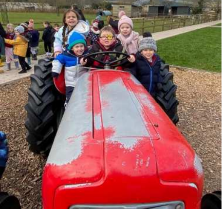
Reception pupils enjoying in Cefn Mably Farm

Our Reception Class and Dosbarth Derbyn pupils went to Cefn Mably Farm as a Tuning In session for their new inquiry. They all thoroughly enjoyed their day observing the farm animals. Their behaviour was excellent all day - well done everyone!