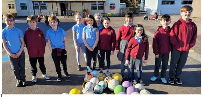
Year 5 celebrating Penguin Awareness Day

In January Class 5 and Dosbarth 5 pupils took part in Penguin Awareness Day and had lots of fun. They carried 'eggs' on their feet, caught fish/krill (bubbles), avoided orca and collected rocks (cones) to build nests. Penguins have such busy lives!