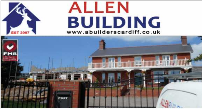
A specialised construction company based in Creigiau with a solid reputation for delivering quality workmanship