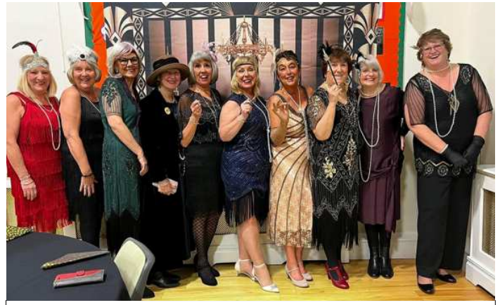
Pentyrch WI current committee members 1920's style Christmas gathering celebrating 100 years of WI

Pentyrch WI meet at 7.30 pm on the first Wednesday of the month