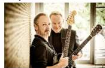
Cutting Crew 13th April 2024