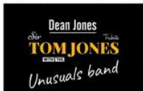
Sir Tom Jones Tribute 1st March 2024

There's something for everyone at Acapela in 2024