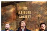
The Leisure Society 26th April 2024