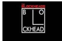
The Blockheads 20th September 2024