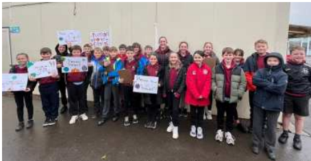
Dosbarth 6 helping to improve our community

Fel rhan o ymchwiliad Blwyddyn 6 ar gynaliadwyedd adnoddau a newid hinsawdd cynhalion nhw arolwg i gasglu data ar sut y teithiodd y cwsmeriaid sy'n ymweld â Tesco yno. Maent wedi defnyddio'r data a gasglwyd i gwblhau gwaith Rhifedd. Fe wnaethant hefyd gymryd rhan mewn gweithred barchus i berswadio'r trigolion lleol i helpu i wella llygredd yn yr ardal leol. Diolch i bawb a atebodd gwestiynau'r disgyblion.