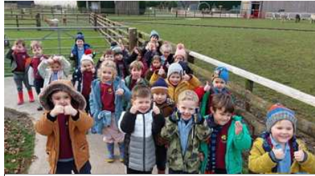
Dosbarth Derbyn in Cefn Mably Farm

Aeth disgyblion y Dosbarth Derbyn a'r Reception Class i Fferm Cefn Mably fel sbardun i'w ymholiad newydd - 'Mae gan y Derbyn Fferm, Hei-a-hei-a-ho.' Roedd pawb wedi mwynhau'r diwrnod yn dod i adnabod yr anifeiliaid. Roedd eu hymddygiad yn wych drwy'r dydd - ardderchog blantol!