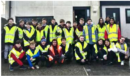
Class 6 enjoying in Cenin Renewables

In January Class 6 and Dosbarth 6 pupils visited Cenin Renewables in Bridgend. They learned about renewable energies and were informed about the energy that is created by Wind Turbines and Solar Farms. They learned a whole host of interesting facts and thoroughly enjoyed the new experience.