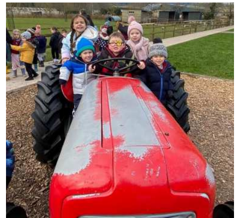
Reception pupils enjoying in Cefn Mably Farm

Our Reception Class and Dosbarth Derbyn pupils went to Cefn Mably Farm as a Tuning In session for their new inquiry. They all thoroughly enjoyed their day observing the farm animals. Their behaviour was excellent all day - well done everyone!