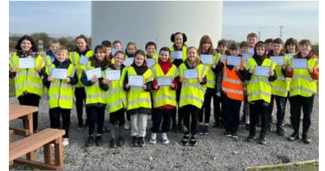
Dosbarth 6 enjoying in Cenin Renewables

Ym mis Ionawr aeth disgyblion Class 6 a Dosbarth 6 ar ymweliad i Cenin Renewables ym Mhen-y-bont ar Ogwr. Dysgon nhw am ynni adnewyddadwy a chawsant wybod am yr ynni sydd yn cael ei greu gan Dyrbinau Gwynt a Ffermydd Solar. Fe ddysgon nhw nifer o ffeithiau diddorol a gwnaethon nhw fwynhau'r profiad newydd yn fawr.