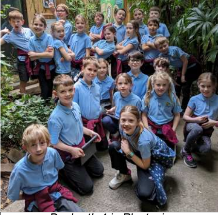
Dosbarth 4 in Plantasia

Ymwelodd disgyblion Dosbarth 4 a Class 4 â Sw Drofannol Plantasia yn Abertawe fel sbardun i'w ymholiad newydd. Roedd pawb wedi mwynhau dysgu mwy am anifeiliaid y goedwig law. Roedd eu hymddygiad yn ardderchog drwy'r dydd - da iawn Blwyddyn 4!