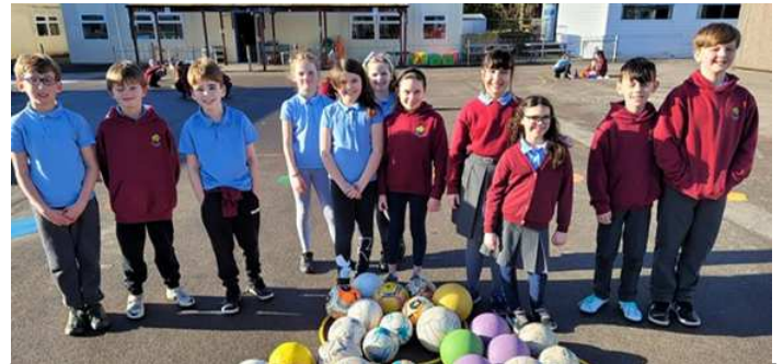
Year 5 celebrating Penguin Awareness Day

In January Class 5 and Dosbarth 5 pupils took part in Penguin Awareness Day and had lots of fun. They carried 'eggs' on their feet, caught fish/krill (bubbles), avoided orca and collected rocks (cones) to build nests. Penguins have such busy lives!