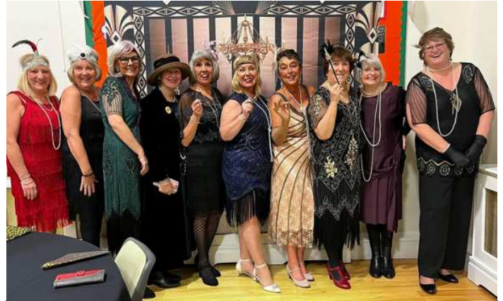
Pentyrch WI current committee members 1920's style Christmas gathering celebrating 100 years of WI

Pentyrch WI meet at 7.30 pm on the first Wednesday of the month