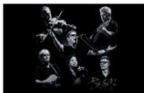
Oysterband 18th and 19th April 2024