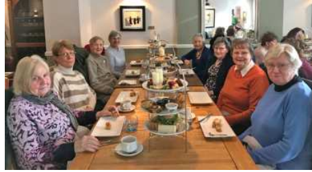
Creigiau WI New Year celebrations

The members of Creigiau WI welcomed in the New Year with a delicious afternoon tea at the Old Post House, St Fagans. (see photo) Our first three meetings this year are:-