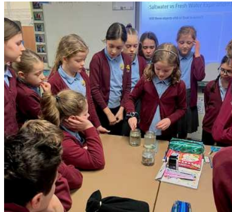
Class 5 pupils enjoying the Flat Holme workshops