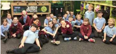
Class 4 enjoying Plantasia

Class 4 and Dosbarth 4 pupils visited Plantasia Tropical Zoo in Swansea as a tnung ion session for their new inquiry. They all thoroughly enjoyed learning more about the animals of the Rainforest. Their behaviour was excellent all day - well done Year 4!