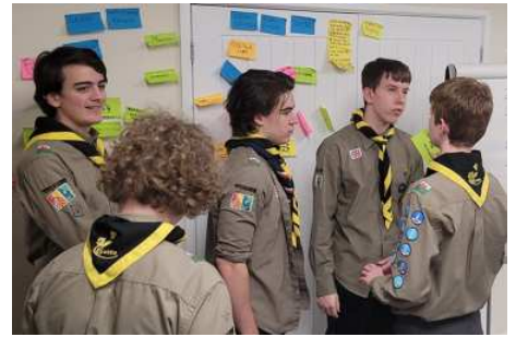
Celts Brainstorming session

For 2024 a challenge has been set by Scout HQ called "Outdoor in 24" to encourage Scouts from all sections to try something new in the great outdoors. Our first meeting of 2024 was a brainstorming session, with the Explorers creating their bucket list of things to do in 2024. These range from simply getting out for a hike, camping, cooking over open fires, climbing, kayaking and to completing an army style assault course!