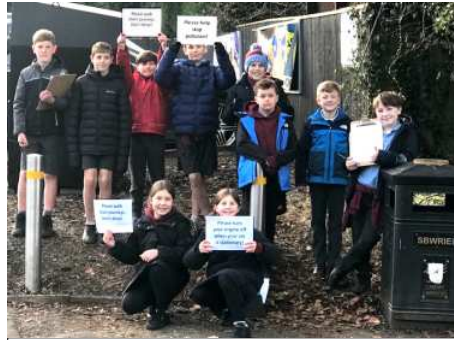
Class 6 helping to improve our community

As part of Year 6's inquiry on sustainability of resources and climate change they carried out a survey to collect data on how the customers who visit the local Tesco travelled there. They have used the data they collected to complete some Numeracy work. They also took part in some respectful action to persuade the local residents to help improve pollution in the local area. Thank you to everyone who stopped to answer the pupils' questions.