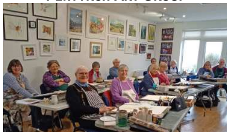
Members in the workshop in Abergavenny