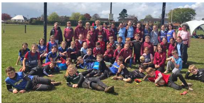
Year 6 enjoying the Rugby Festival