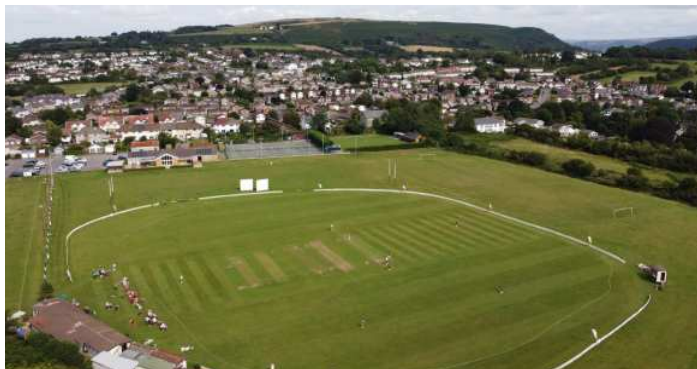
Parc y Dwyrlyn Area Showing the Cricket Pavillion and Pitch, Rugby Pitch and Clubhouse, Soccer Pitch, Tennis Courts and Bowling Green

Most residents in the area will have used the facilities at Parc Y Dwyrlyn or Pentyrch Rugby Club or simply Pentyrch Playing Fields over the years. It is a wonderful facility that is enjoyed by all ages and provides a variety of sports, dog walking and social events.