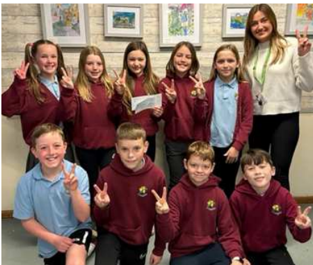
Raising funds for Velindre

Gawson ni lawer o hwyl yn creu 'enfys' ar iard yr ysgol! Bu'r disgyblion hyn yn trafod sut y bydd yr arian a gasglwyd yn cael ei ddefnyddio i gefnogi elusennau sy'n helpu sicrhau bod gan blant ledled y byd hawl sylfaenol "i oroesi a ffynnu". Buon nhw'n trafod Hawliau'r Plant a pha mor freintiedig ydyn nhw i'w cymharu â rhai plant ledled y byd. Codon ni £340 a gwerthon ni 200 trwyn coch.