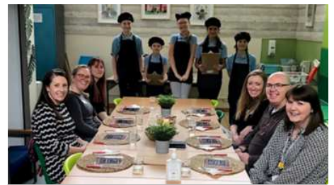
Friends of the School enjoying their lunch!