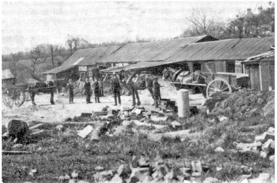
Owen & Davies Builders Yard - 1925.