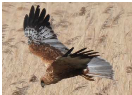
Marsh Harrier at Ham Wall

2023 is a special year for RSPB Cardiff and District Local Group as we are celebrating 50 years in November. We're a long-running, volunteer-led friendly group who enjoy all things 'birds' and nature and we arrange fundraising indoor and outdoor events. This year we've had successful trips to Newport