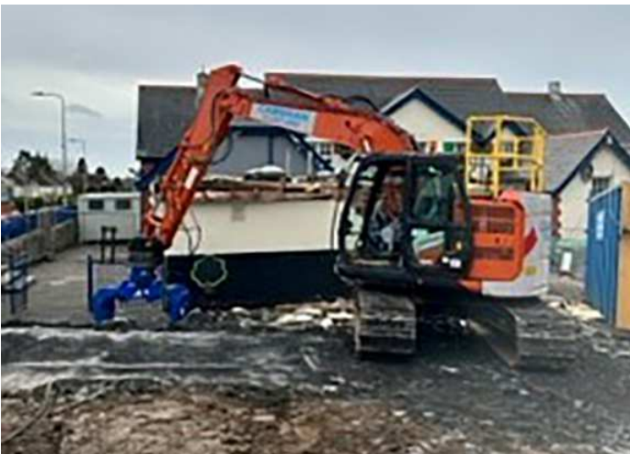
Demolition of the old building to enable the extension to be constructed.

The Lord Mayor spent time finding out more about the project with the school's pupil representatives before joining the rest of the school outside for a count down and commencement of the demolition of the old building to enable the extension to be constructed.