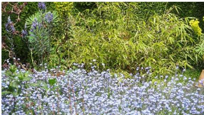
Forget Me Nots

It's that time of year again when nature is yellow with gorse, broom, primroses, cowslips celandines and of course daffodils in abundance. From yellow the season slides into blue with the flowering of bluebells, muscari and forget-me-nots. Summer is the time for hot vibrant colours before the onset of autumn.