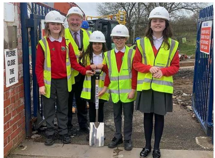
Left to right- The Lord Mayor of Cardiff, Councillor Graham Hinchey, and pupil representatives.

The extension will not only enable nursery provision with wraparound care to be established for the community but will also create two further purpose-built classrooms for younger pupils with outdoor facilities. This will further establish the school at the heart of the community whilst meeting the demand for school places in the local area. Nursery places and wraparound care will be available from September 2023.