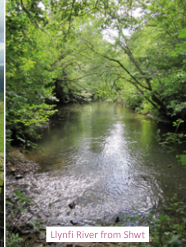
Llynfi River from Shwt