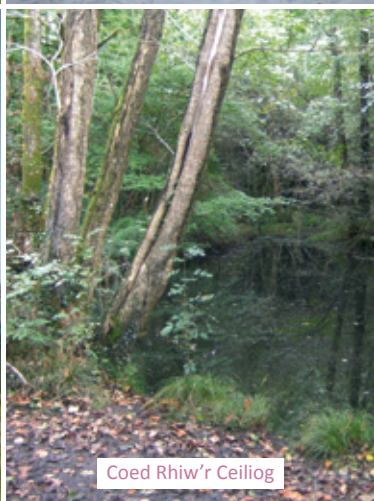
Coed Rhiw'r Ceiliog