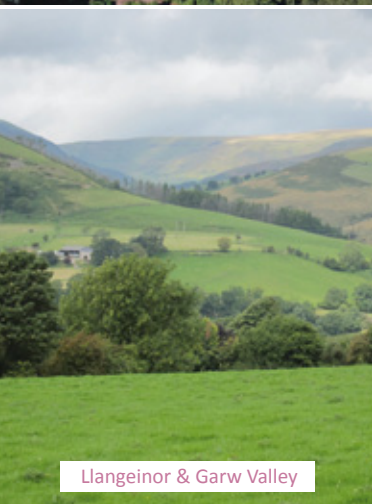
Llangeinor & Garw Valley