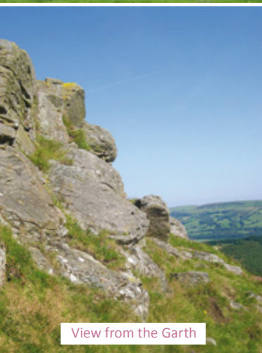
View from the Garth