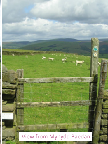
View from Mynydd Baedan