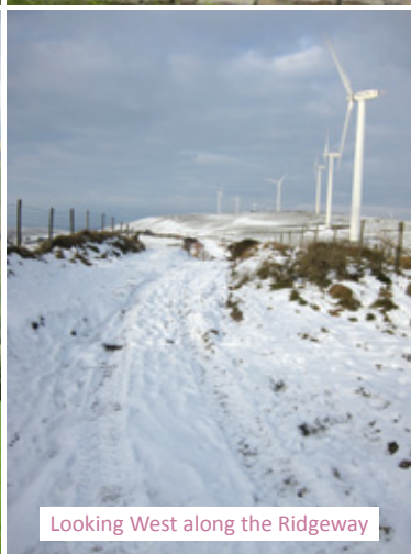
Looking West along the Ridgeway