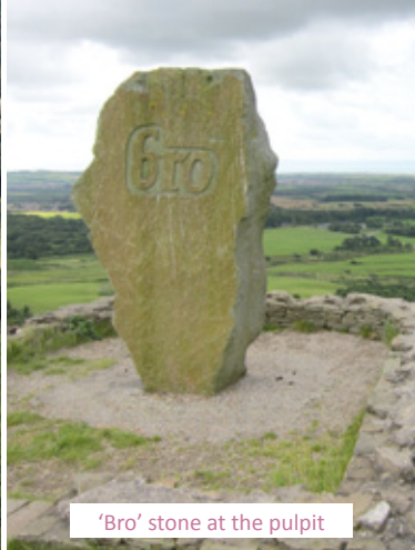
'Bro' stone at the pulpit