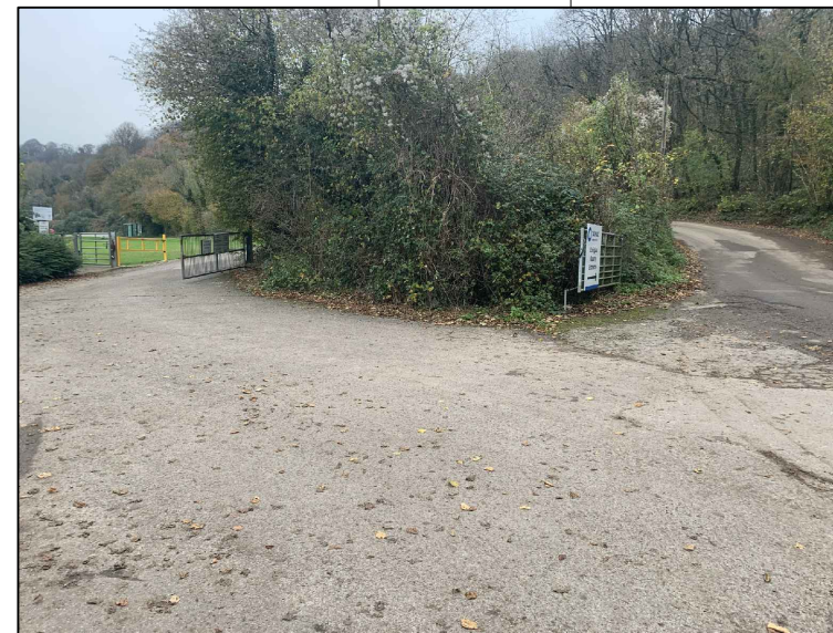
ALL EXISTING VEGETATION BETWEEN ACCESS GATES TO BE REMOVED