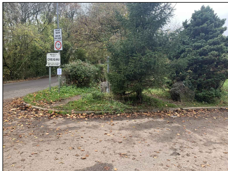
EXISTING TREES TO BE REMOVED TO ENSURE CROSSING VISIBILITY