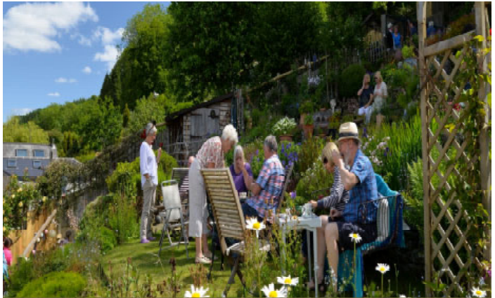
Flowers and Tea - A Winner!

Another successful open garden event at The Old Post Office in Gwaelod y Garth was held on the first full weekend of June. By the close of day on Sunday over 333 paying visitors had visited the garden.