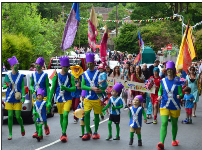
A look back to Summer 2014 as Creigiau Carnival in the sunshine progresses to the Recreation Field