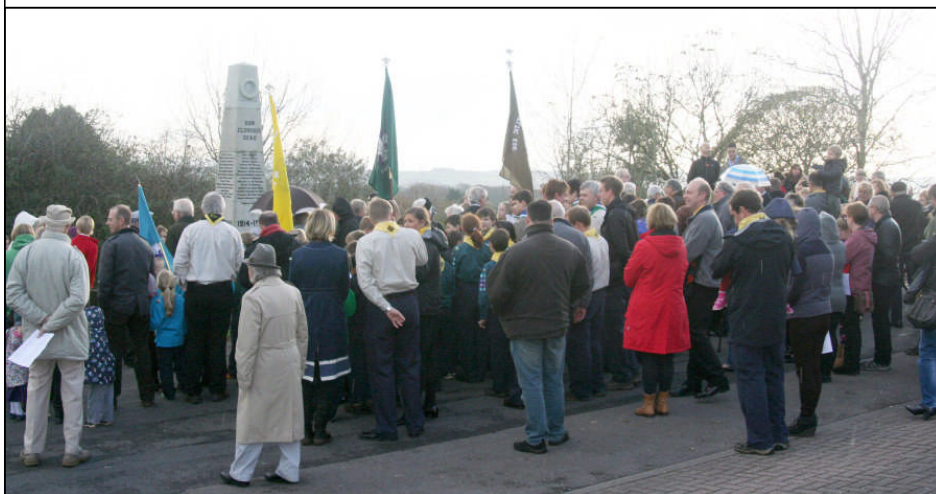
On Sunday the 9 th November 2014 a significant congregation gathered at the Pentyrch War Memorial for the Annual Service of Remembrance