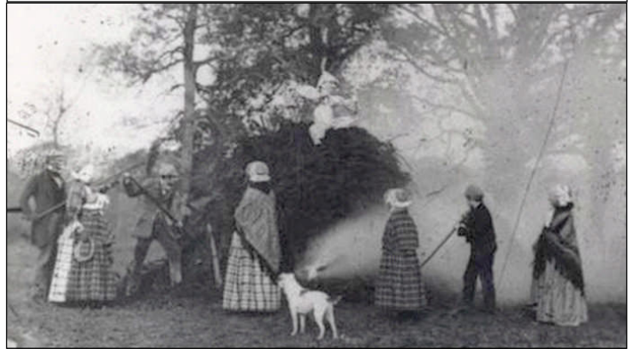
Remember, Remember the 5th of November" by John Dillwyn Llewelyn

Did you know it was an exiled Welsh Spy who introduced Guy Fawkes to the other men? The plan to blow up Parliament was concocted in May 1604. It is thought that Thomas Wintour was the prime mover in the little gang of plotters and that Guy Fawkes was simply a tool towards the execution of the plot. Along with Tom and Robert Wintour, the Welsh spy, Hugh Owen, was deeply involved. He knew Guy Fawkes - and knew he had considerable military expertise and an understanding of gun powder. So, this exiled Welsh man introduced the man we commemorate for Gun Powder Plot.