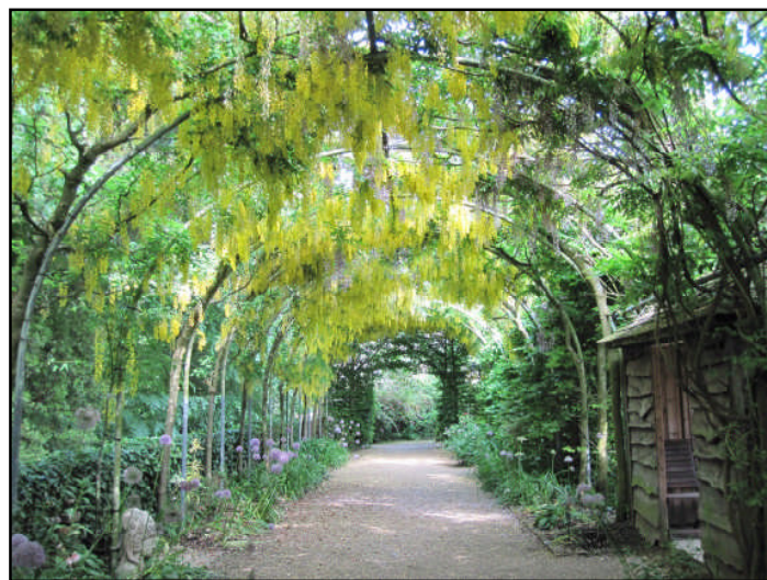
Laburnum Arch, Abbey Gardens