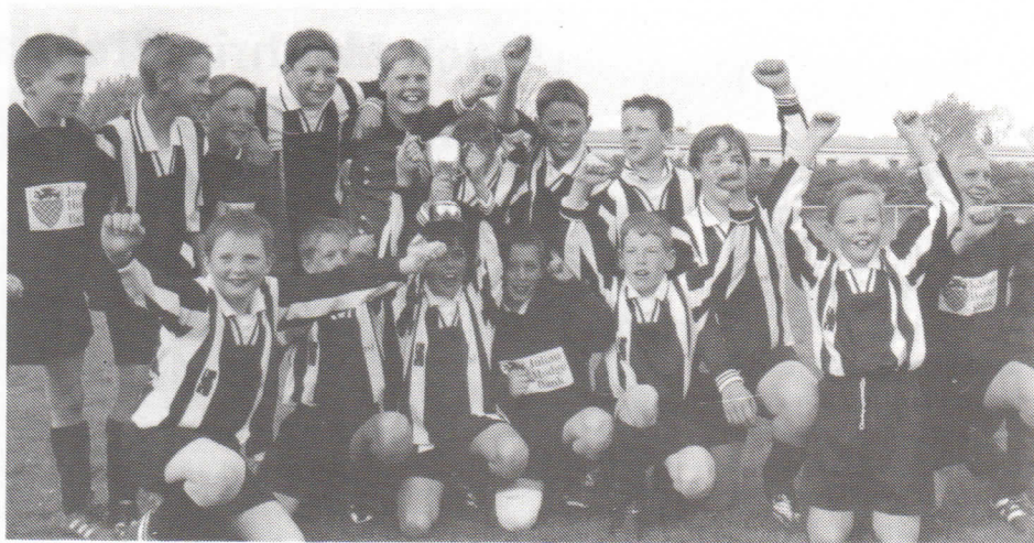
Pentyrch Rangers U12's with the Cardiff and District League Cup.