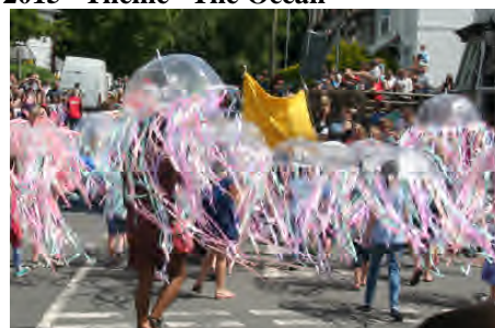
Creigiau Brownies - Jelly Fish