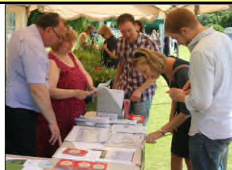
Overlooking the quarry drawings at the Creigiau Carnival

The Local Development Plan is also still ongoing. We have managed to get the Council to make some changes to the plan, such as protecting the old railways line routes for any future Metro, but that doesn't guarantee it will be built as