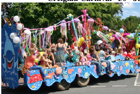
Cylch Meithrin - The Reef