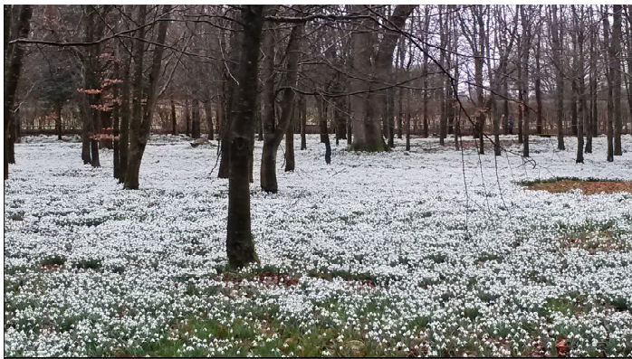
The Snowdrops at Welford Park