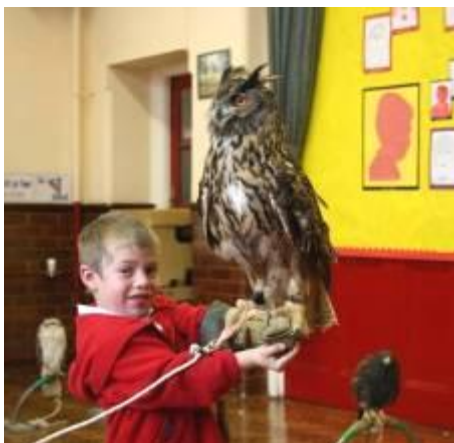
Bird of Prey Visit