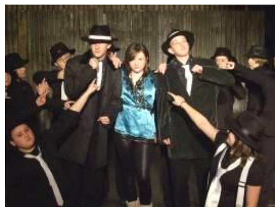
Teulu'r Mordecai fu'n ceisio dwyn y Nadolig