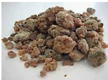
Harvested Granules of Myrrh

From a biological point of view the Myrrh tree has evolved the resin over millions of years as a sap or exudate to protect itself if injured. It is not surprising therefore that the mixture contains many chemicals of a defensive nature. We now know that the mixture in fact contains hundreds of different compounds, some are volatile and some in the form of oils and gums. The plant uses these to seal or plug any wounds made in the bark. Many of the natural chemicals in the resin will repel insect