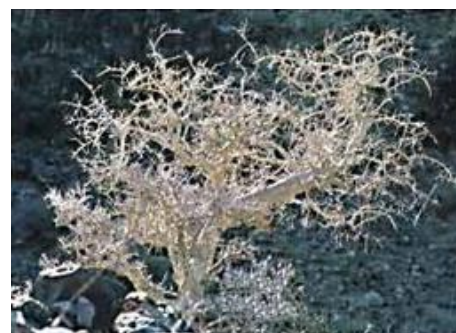
Myrrh Tree Commiphora molmol