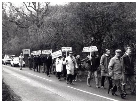
Garth Hill Protest 1989

Since that time, the quarry has been the subject of take-over and has repeatedly changed hands. However, Redland/ Lafarge, RMC and Cemex, have all had to agree to the same set of Legal Agreements. Local people, who had campaigned for a fair deal since 1987/8 onwards, were reassured by CCC that the planning clauses were immutable. Few of us understood that Legal Agreements