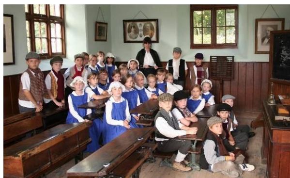
Year 5 experienced a Victorian school day at the Museum of Welsh Life.