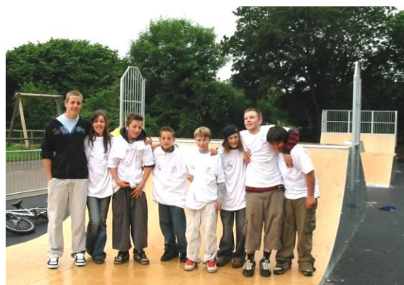
The first happy users of the new skateboard park.

Yn dilyn cwblhau y twnel gosodir y gwaith prosesu yng ngwaelod y chwarel yn 2007 ac erbyn 2009 bydd yr holl weithfeydd a stoc wedi eu symud o ben y chwarel.