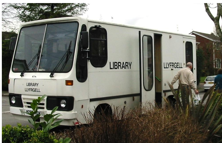
The Mobile Library in action