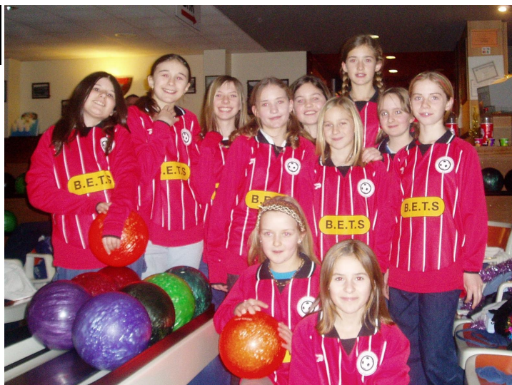
U12 Pentyrch Rangers AFC girls in their new kit

Teams: 6 at varying levels in South Wales League