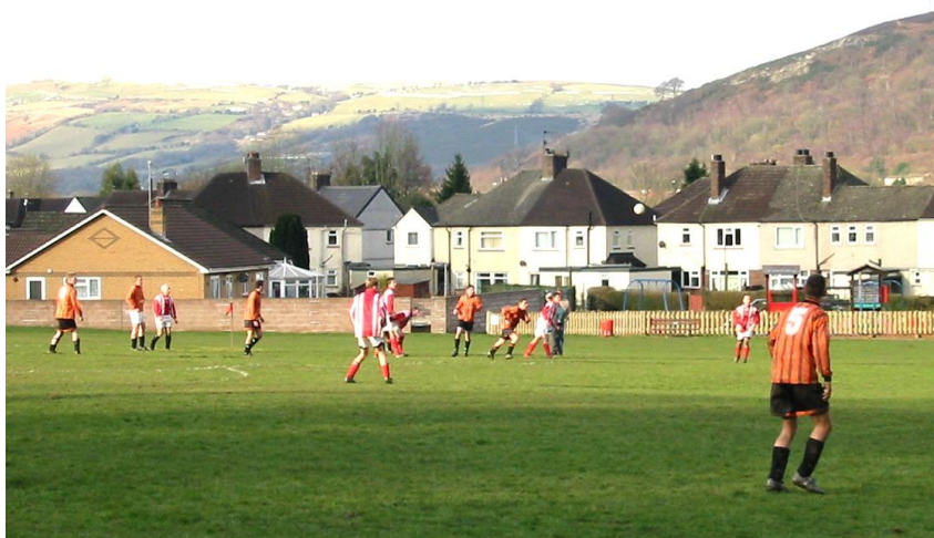
Gwaelod y Garth v Fairwater (Spot the ball?)