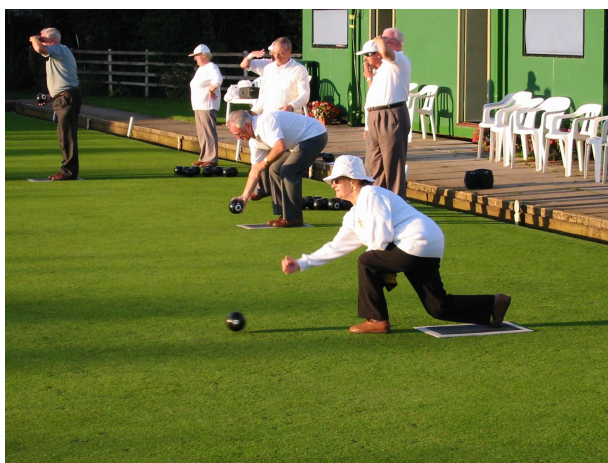
Keen Pentyrch bowlers

Come and join us your never to young to start!