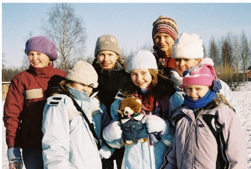
Girls from Pentyrch Primary and Suutarila School pictured with Barnaby Bear

We did of course visit Suutarila School. Our children were shown around the very impressive school facilities by their hosts. They attended lessons in subjects such as Maths, Woodwork, Music, ICT and Physical Education. The school is known as a 'service centre school' and houses a kindergarten, primary school, gymnasium, craft and IT rooms, music and drama studios, health centre, dental surgery and library. The local