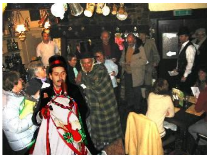
Mari Lwyd Clwb y Dwrllyn yn y King's Arms yn dathlu'r Hen Galan