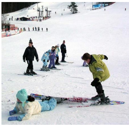
Skiing is not as easy as it looks!