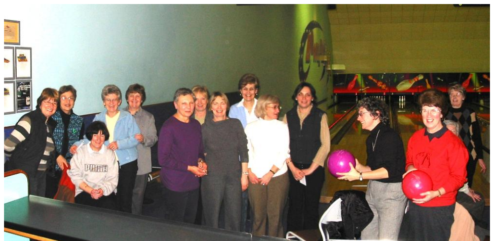
Merched y Wawr Cangen y Garth yn mwynhau noson o Fowllo Deg